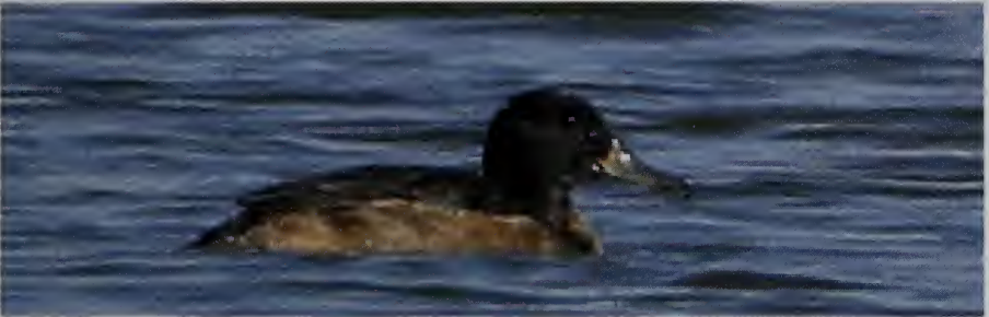
Figure 3. Black-headed Duck Heteronetta atricapilla , laguna Capirenda, near Boyuibe, dpto. Santa Cruz, July 2005; the first documented record for Bolivia in 90 years